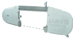
Buster IX Bandsaw