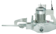
MG-1E Beef Brisket Saw