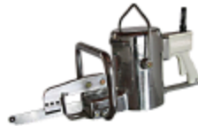
EBS-1 Electric Beef Brisket Saw